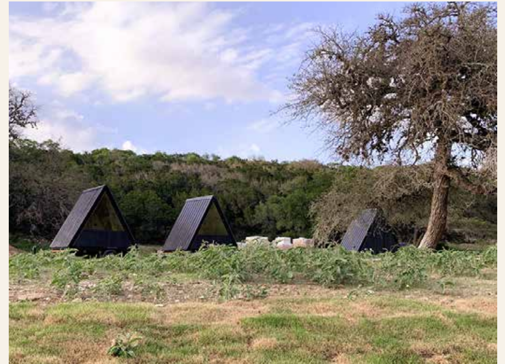
CAMP FIMFO, TX