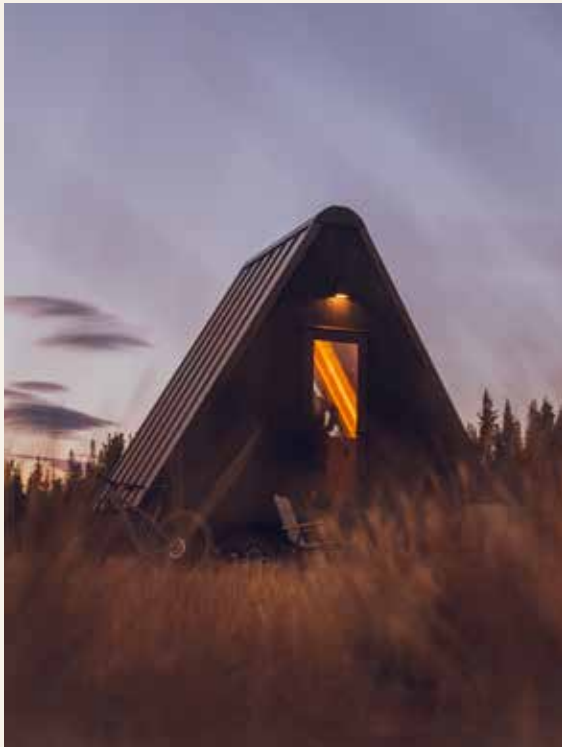
HIGH DESERT CABIN, OR