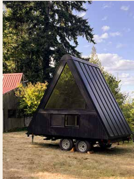
ARTIST RETREAT, WA