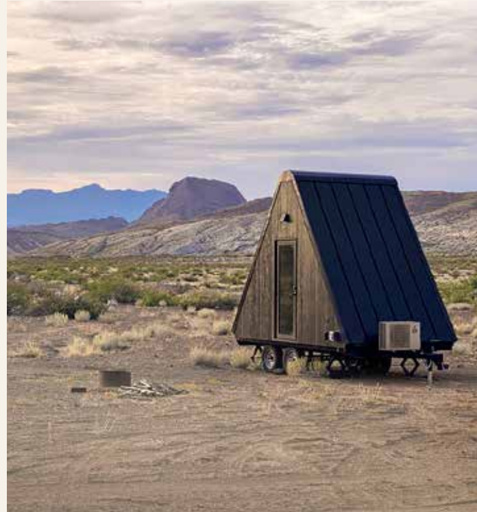
BIG BEND NTL PARK, TX