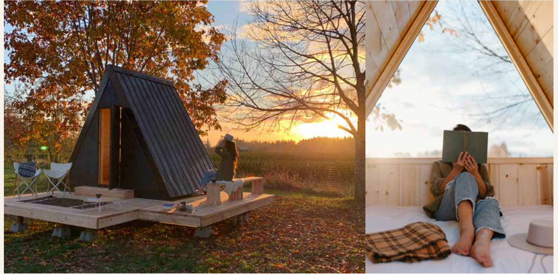
FIVE OAKS FARM, OR