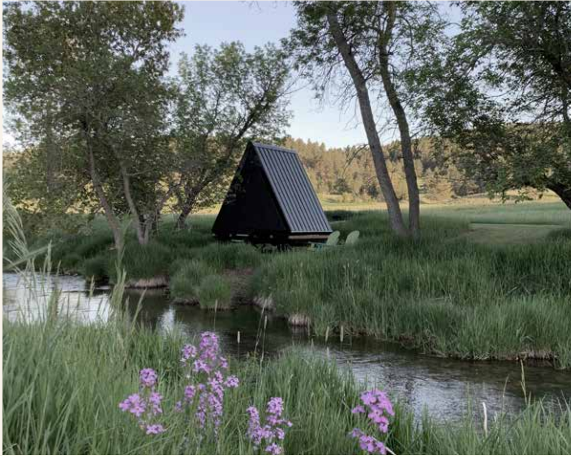
BLACK HILLS, SD